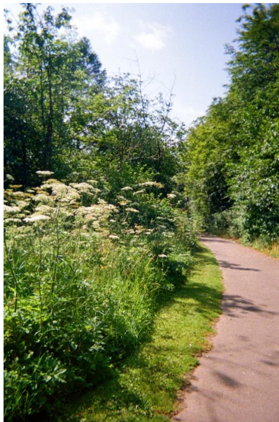
"The beautiful Ravenswood Reserve."