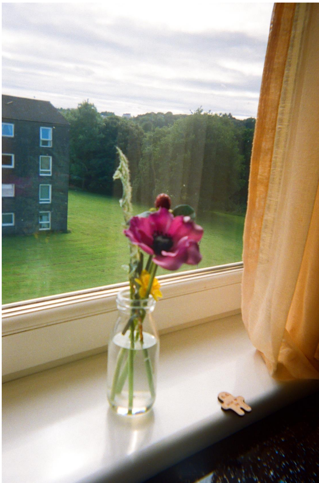
"My little 'hug' sitting on my windowsill, sent from England by my lovely granddaughter during lockdown. I miss her so much."