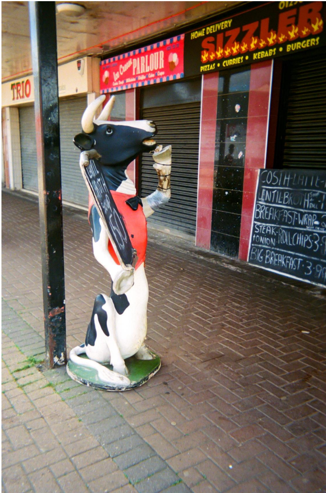
“‘The Bull’ outside the takeaway in Abbronz hill town centre.”