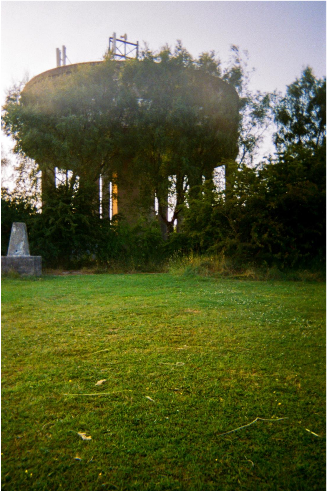
"The water tower, Carrickstone."