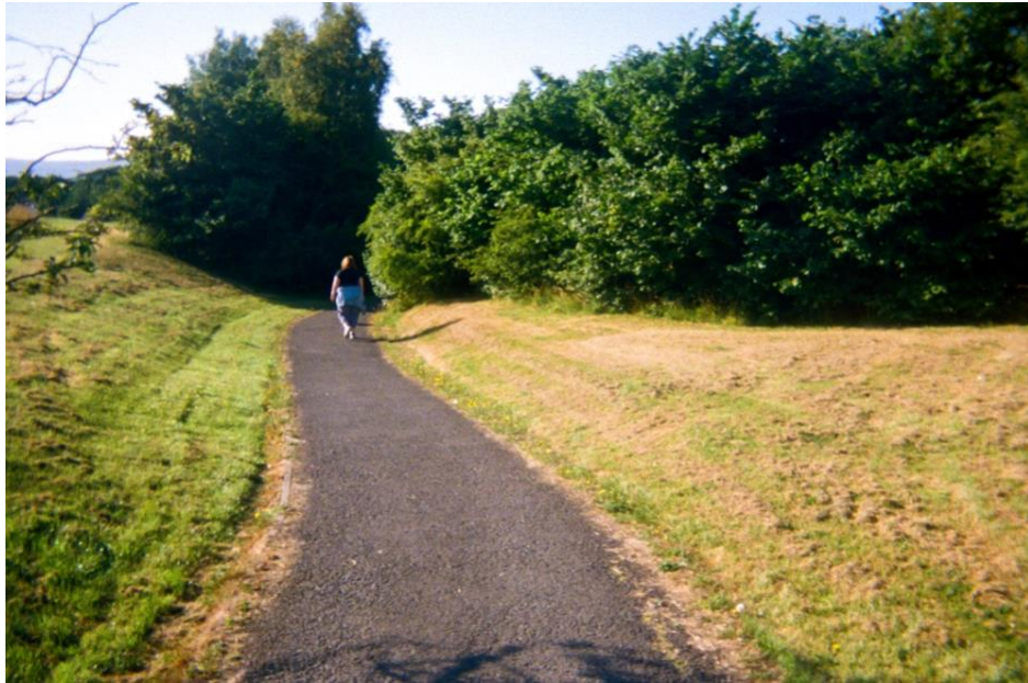
"A shortcut to the town centre from Greenfaulds."