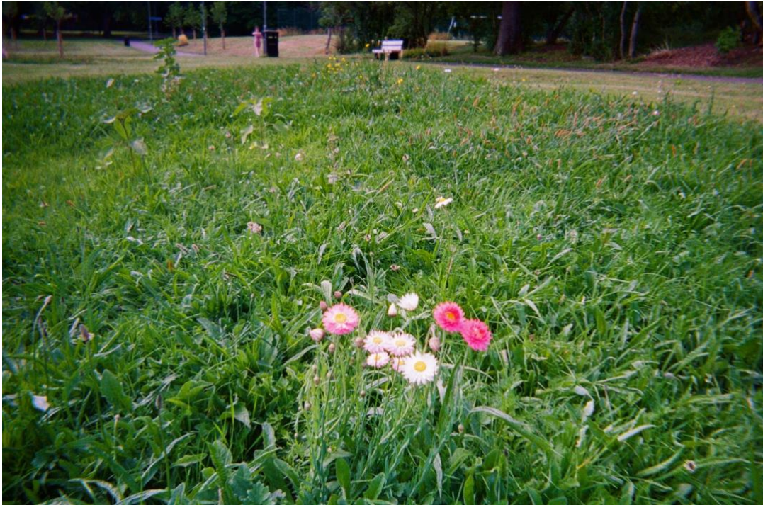
"A little group of wildflowers on the Kildrum walkway towards the town centre."