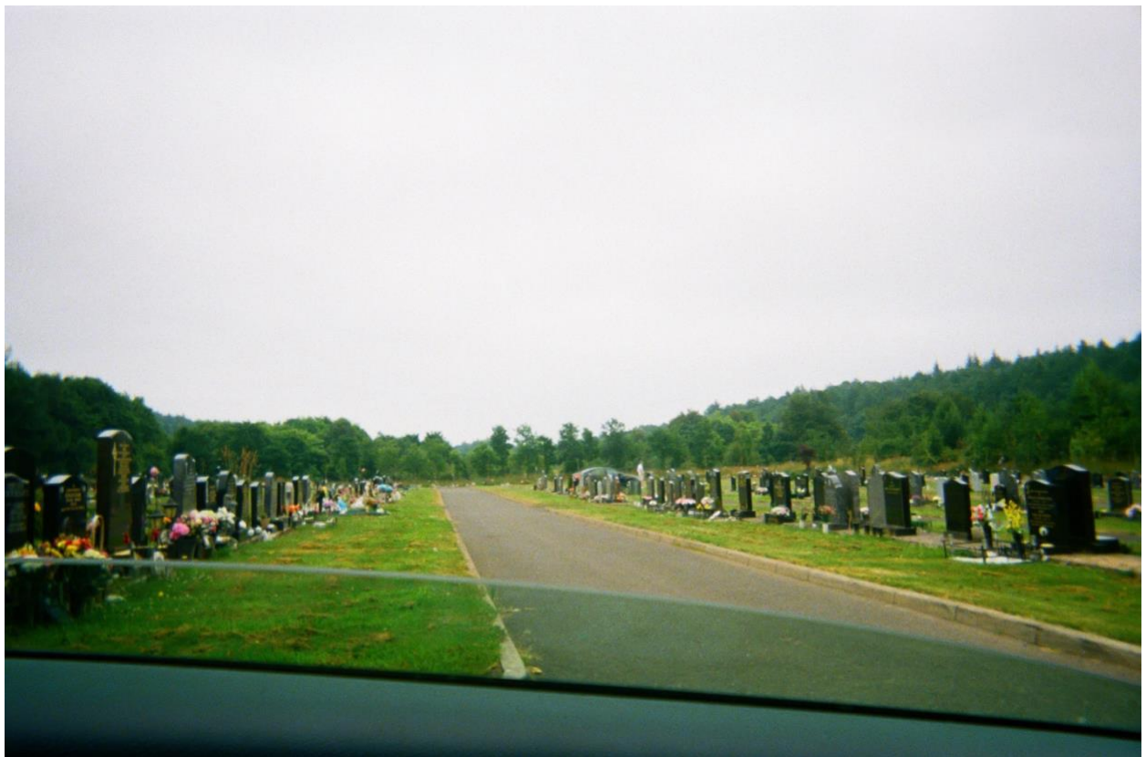
"Visiting family in Eastfield Cemetery."